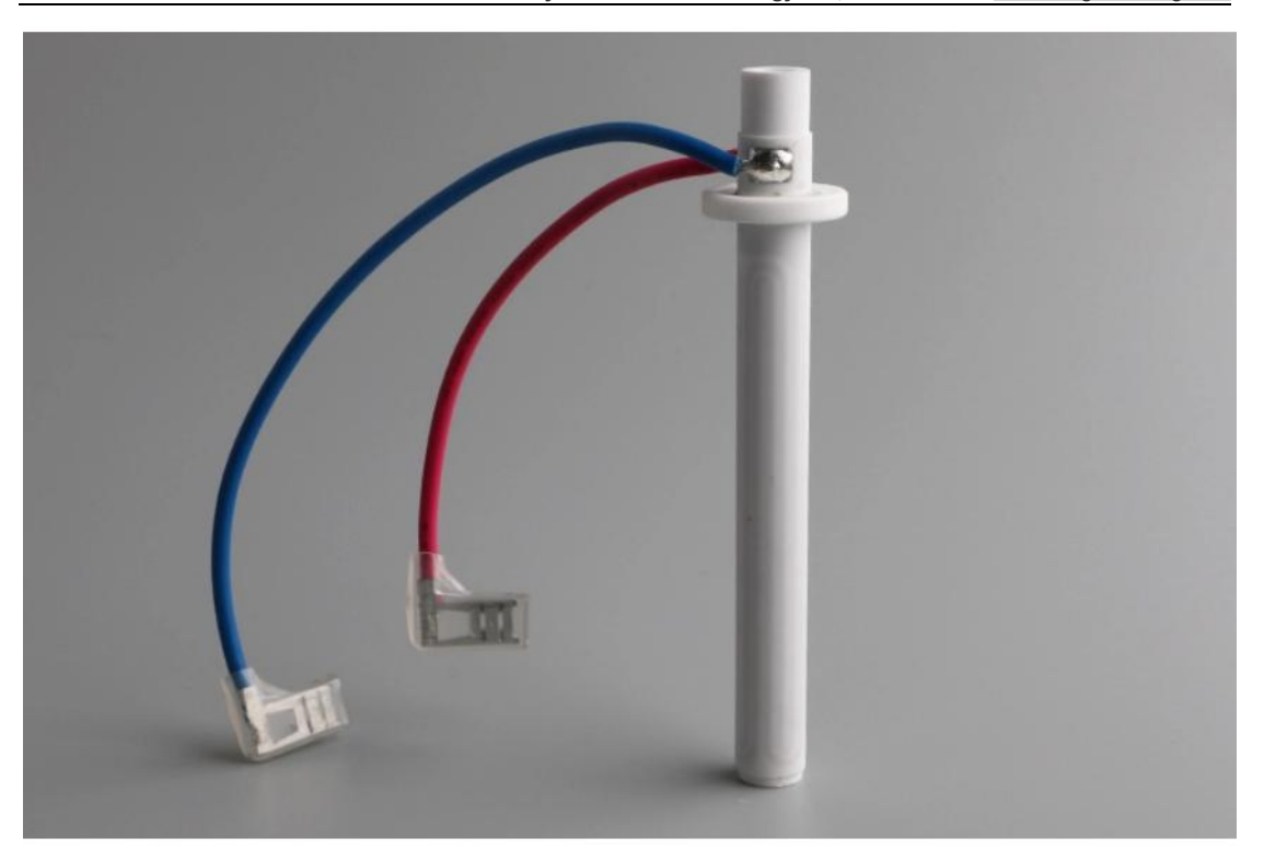
Material Properties of Ceramic Water Heater Element for Instant Toilet Seat