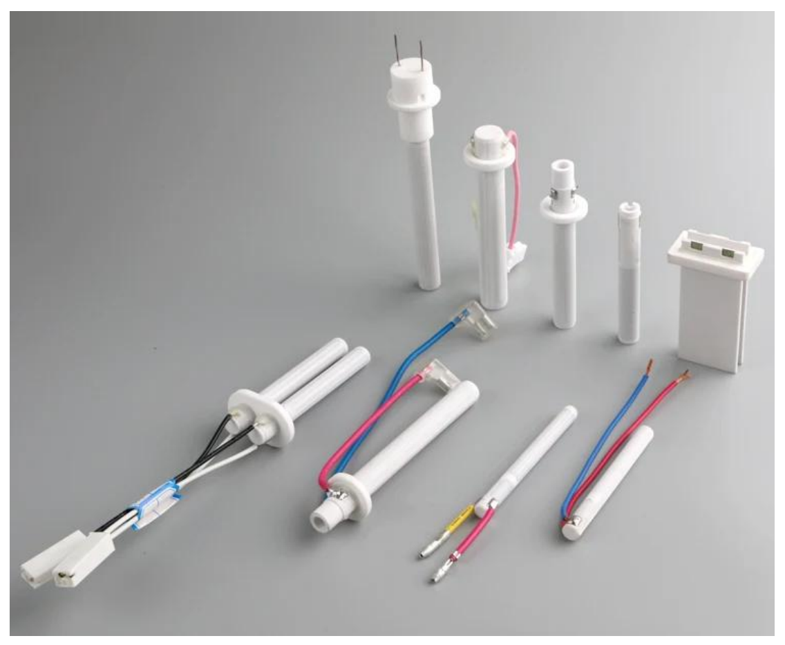
Features of Ceramic Water Heater Element for Instant Toilet Seat

Ceramic water heating tube are high quality electric water heating solution. They do not rust, they do not scale and their lifetime greatly exceeds that of standard water heating element. They are also more efficient in converting electrical power to heat in water. While standard elements peak in efficiency of no more than about 80%, the ceramic water heating elements can achieve 90% or more efficiency in water